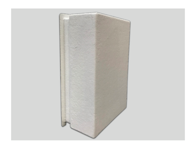
Wall Mounted GRP Cover

Flowpac SS CAT5 Wall Mounted Booster Sets