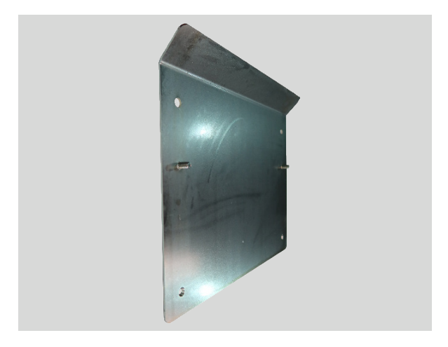
Wall Mounting Bracket

Stainless steel wall mounted cabinet with wall mounting bracking